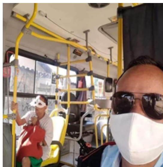
Figure 13 clear whereas the an anti-virus disk for

Covid-19 was also thought to be prevented or perhaps eradicated completely by the use of anti-viral agents or pure alcohol as demonstrated by the persons in Figures 14 and 15 respectively. In Figure 14 , the woman employed a sachet of liquor, which brand is not clear whereas the woman in Figure 15 is wearing a compact disk, notably an anti-virus disk for computers. The Coronavirus is said not to survive in alcohol that is not less than 60%. Needless to say, this percentage of alcohol is said by experts to only be effective in hand sanitizers in particular and not as imbibed by some persons as a beverage or whatsoever. What is even more striking is the fact the woman in Figure 14 is not consuming the alcohol but employing the entire package as a face mask. At least she positions it over her nose.