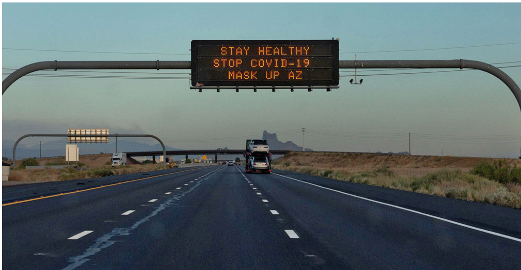
USA, The Economist, photo from Reuters

Verbs are not immune. We have 'mask up' in the US (see below) which you probably won't need to do if you are 'Zooming' ( this is what teaching used to be called - Ed. ).